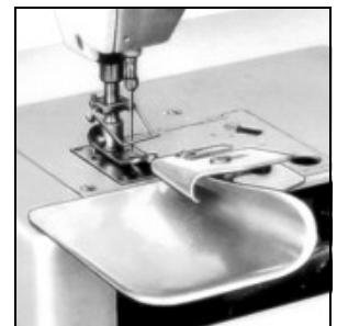
Sewing parts and hemmer A9795 used on 56100TBT

Same as 56100MZ27BT, but equipped with hemmer A9795.