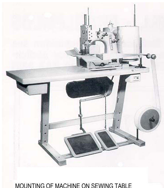
MOUNTING OF MACHINE ON SEWING TABLE WITH CLUTCH MOTOR