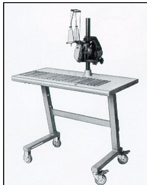
Style 2200 AT with Pedestal H1400T and Table 90709PS

Additional bag feed-in guide 2103E recommended for easier guiding the bag and label (work aid).